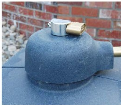
AGL-4 Shown on HySecurity