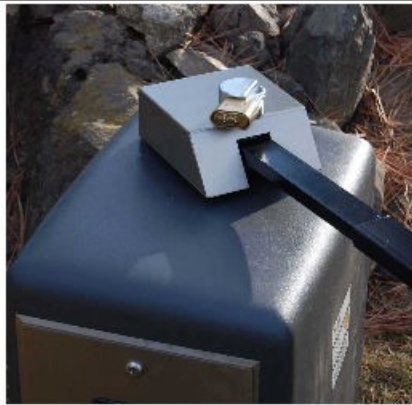
AGL-1 Shown Installed on CSW-200UL with Cover